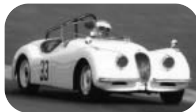
33 1952 Jaguar XK-120 3781cc James Alder