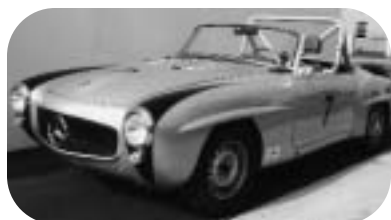
47 1955 Mercedes 190SLR 1877cc Gary Cox