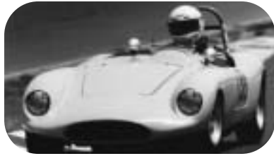
58 1955 Cleary Special 900cc Kevin Pitts