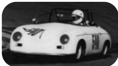
540 1955 Porsche 356 1488cc Jack Richards