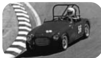
56 1952 Siata 300 BC 870cc Marty Stein