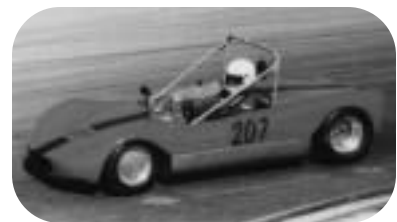
207 1965 Miller-Crosley Special 975cc Franklin Rudolph