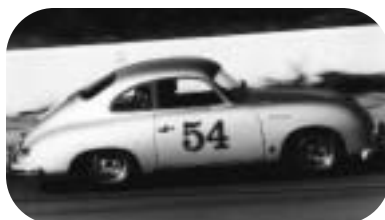
54 1955 Porsche Continental 1500cc Clint deWitt