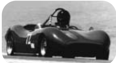
72 1955 Crosley Special 783cc Leland Osborn